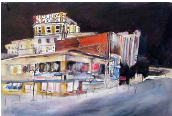
COLORED LANDSCAPE PAINTING